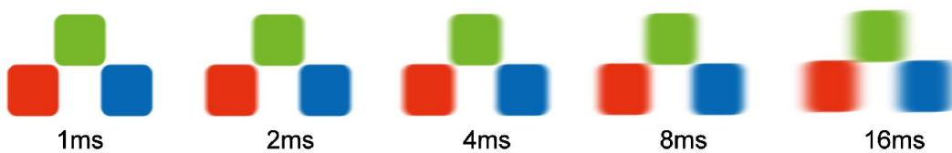
Picture 2: a demonstration how persistence blur effects

This neat term means, how the objects are blurred on the display while an eye tracks objects from the display. There is not any standard for the persistence value, but a state of the art PC with VR will achieve a persistence value of around 1-2ms. The limit where the subjective experience for some people starts to worsen seems to be around 5ms. The Pixel's 5.1ms persistence value seems to just barely meet that threshold. On the other hand, the Gear VR's 3.4ms persistence value seems to be much closer to the high end of VR capable devices. For example, the brand-new Sony PS4 VR platform has a persistence value of 2.5ms.